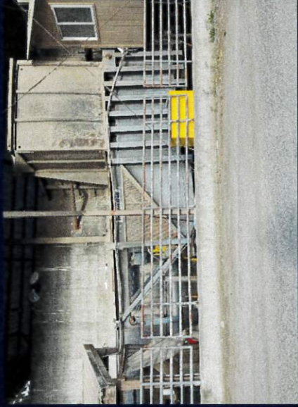
1995 Harris TP150 Compactor