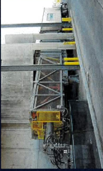
2024 SSI 2500 SPH Compactor